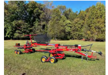
2024 NH Prorotor 3223 2 Available - (T, R)