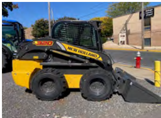
24/25 NH L320 12 Available - (T, N, R, D)