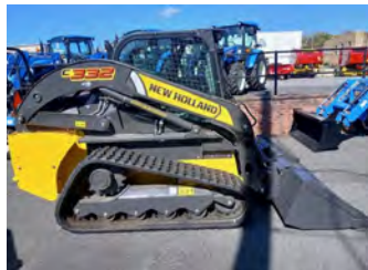
2024 NH C332 2 Available - (T, N)