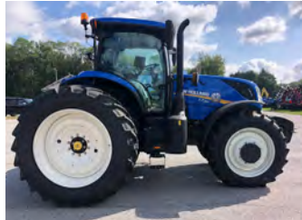
2023 NH T7.260 Tag #38531 - (D)