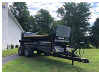
2024 Tubeline 575RS Tag #39482 - (D)