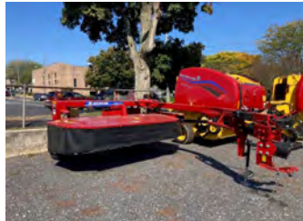
2024 NH 210R 3 Available - (T, N, R)