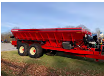
2024 BBI Endurance Tag #39424 - (D)