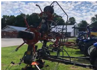
2024 PQ HT66X Tag #39478 - (D)