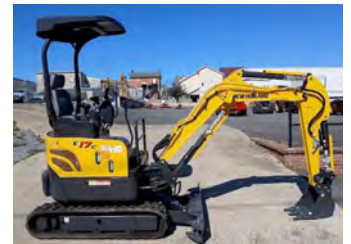
23/24 NH E17C 3 Available - (N, R, D)