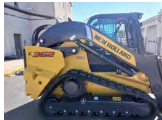
2024 NH C362 4 Available - (T, N, R, D)