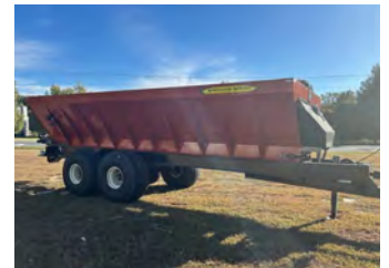
2023 PQ SP550 Tag #38615 - (D)