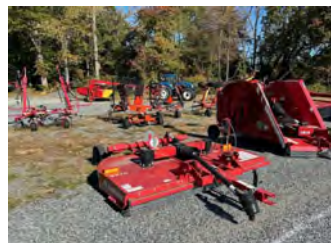
2023 Bush Hog 2310 2 Available - (T, R)