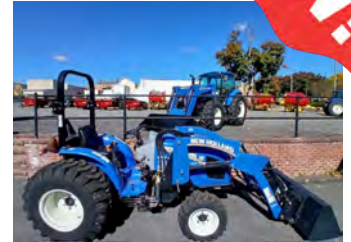
2023 Workmaster 35 6 Available - (T, N, R)