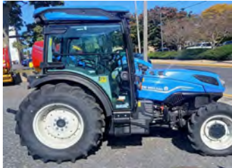
2023 NH T4.100/110F 4 Available - (T, N, R, D)