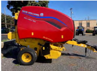
2024 NH RB450 SS 2 Available - (N)