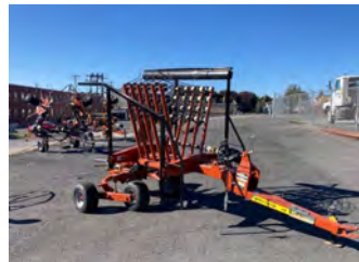
2024 PQ HR1140 2 Available - (N, R)