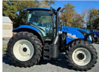
2023 NH T6.160 2 Available - (R, D)