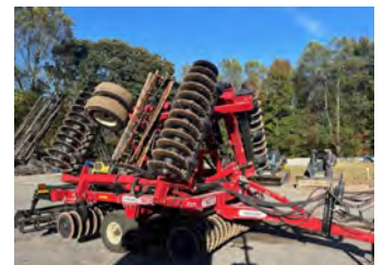
2023 McFarlane IC5124 Tag #38610 - (D)