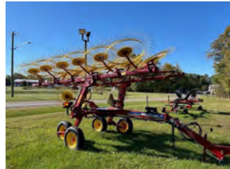
23/24 NH Procart 1225 PLUS 3 Available - (T, R)