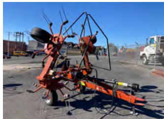
2024 PQ HT4102 3 Available - (N, R, D)