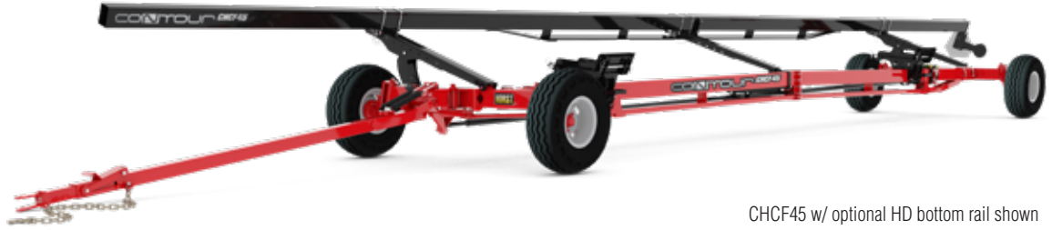
CHCF45 w/ optional HD bottom rail shown