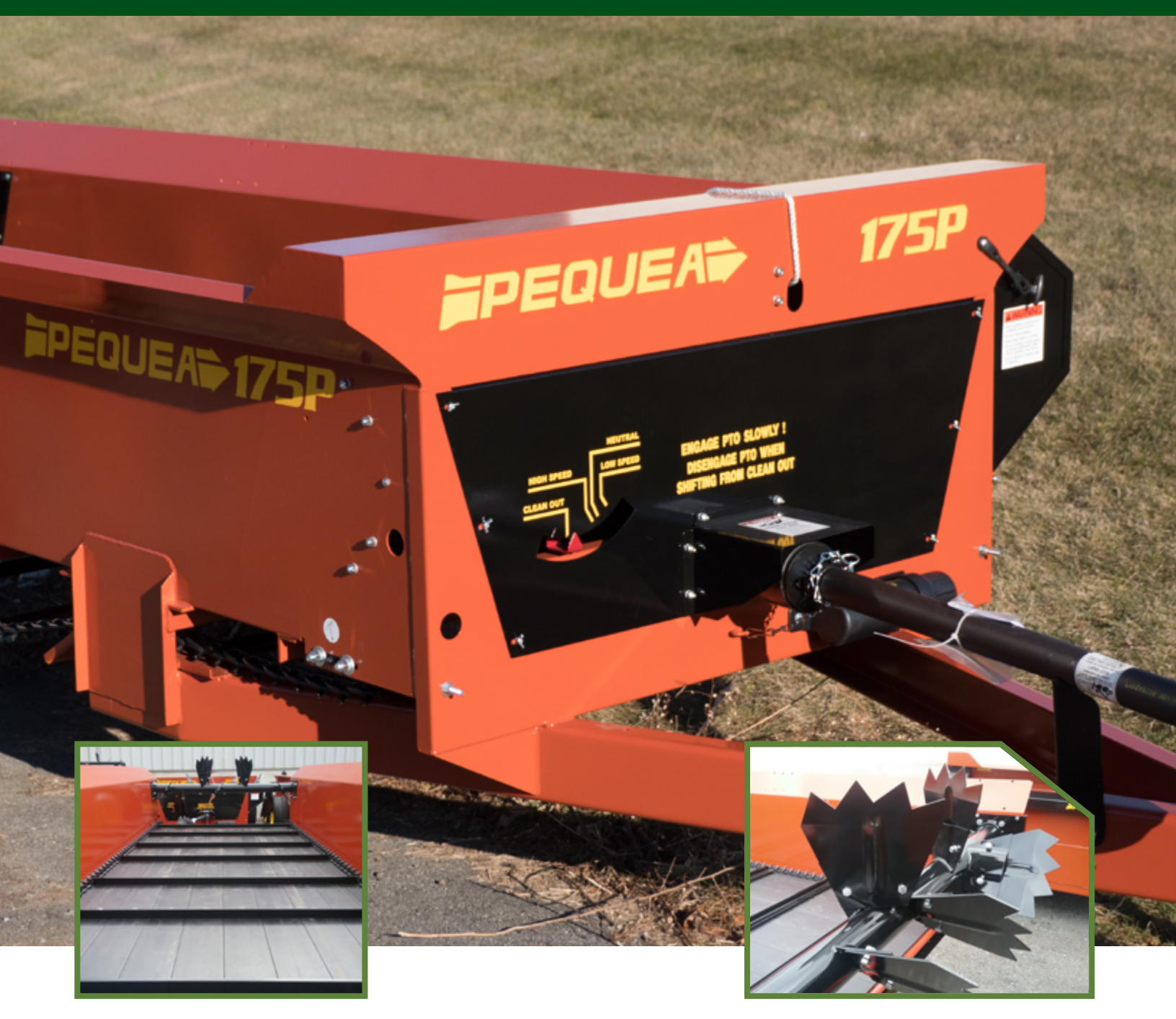
The poly floor helps prevent freezing and never wears out.

The 175P model has 10 removable beater paddles