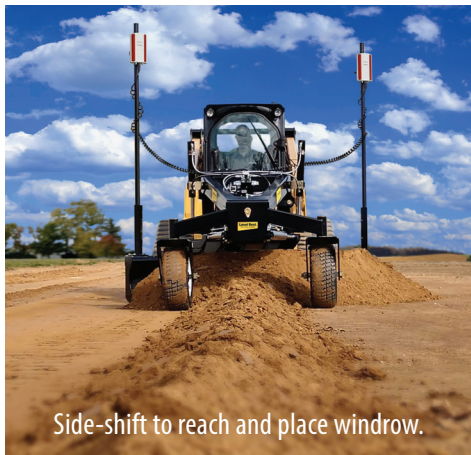
Side-shift to reach and place windrow.

Many prefer a grader blade over a box grader. Now you can work in windrows with the ability to adjust the working width of your precision grade. Smooth operation, and legendary Level Best performance.