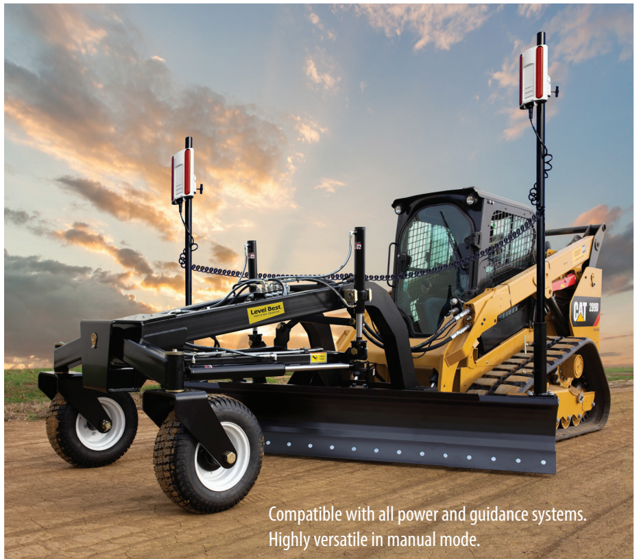
Compatible with all power and guidance systems. Highly versatile in manual mode.

Shown equipped with available Level Best EarthWorks Go guidance system