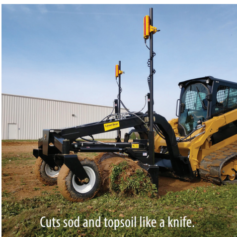
Cuts sod and topsoil like a knife.