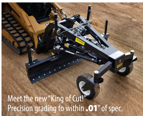
Meet the new "King of Cut!" Precision grading to within .01" of spec.