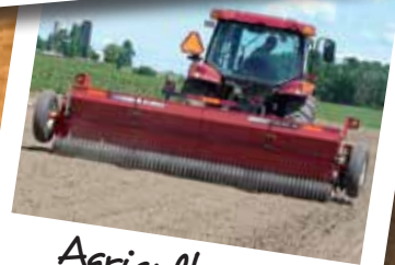
Agricultural & Landscape Seeders