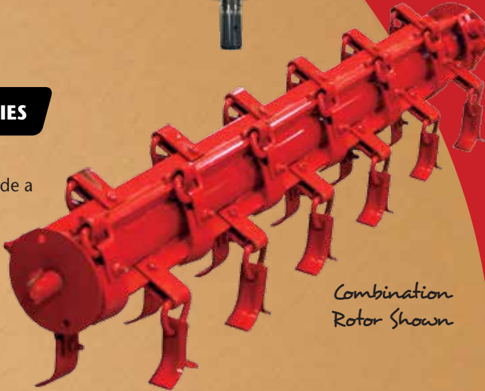
Combination Rotor Shown

Dynamically balanced Rotor Assemblies provide a vibration free, smooth operation. Rotors can be equipped with all Cup Knives, all Side Slice Knives, or a combination of both to match a wide variety of applications.