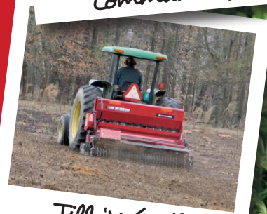
Till 'N Seed®