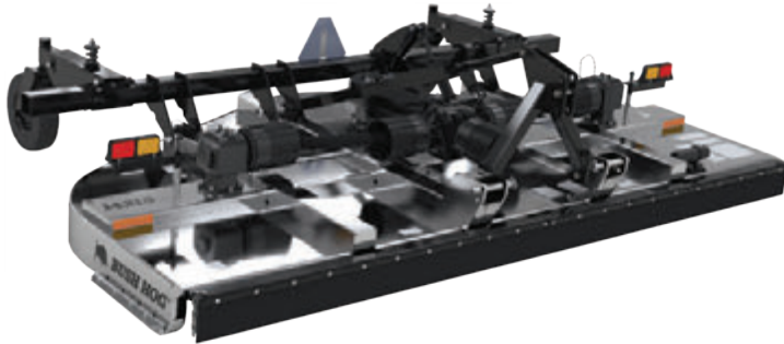
14215 FRONT VIEW